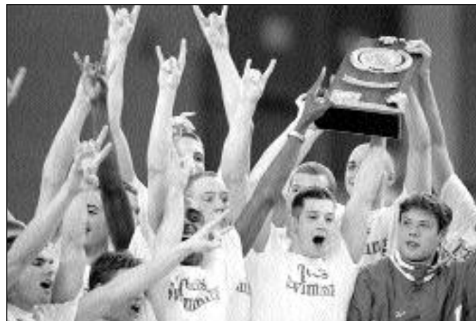
The Texas Longhorns claimed victory at the NCAA Division I Men's Swimming and Diving Championships in Minneapolis.