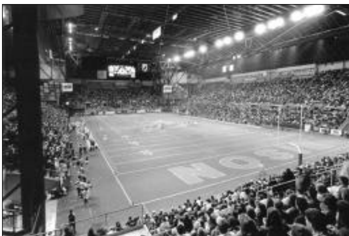
North Dakota State plays its home games in the FargoDome. With a capacity of 18,700, it is the second-largest venue in Division II.