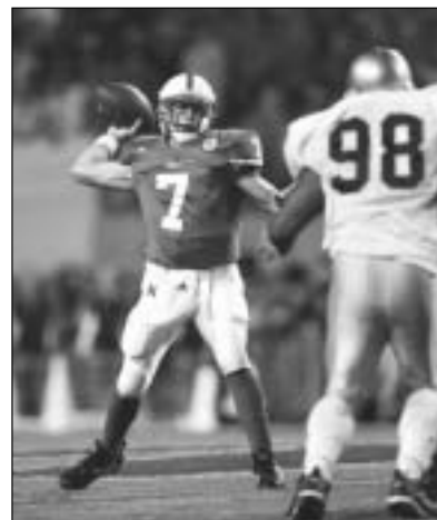
Nebraska's Eric Crouch won the Walter Camp Award and the Davey O'Brien National Quarterback Award in 2001, in addition to receiving the Heisman Trophy.