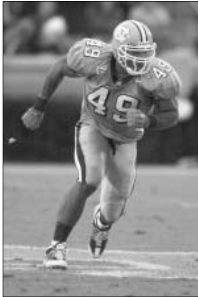
North Carolina sports information

Julius Peppers became the first North Carolina winner in the 32-year history of the Vince Lombardi/Rotary Award in 2001. Peppers also was the recipient of the Chuck Bednarik Award.