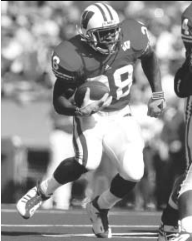
Wisconsin sports information