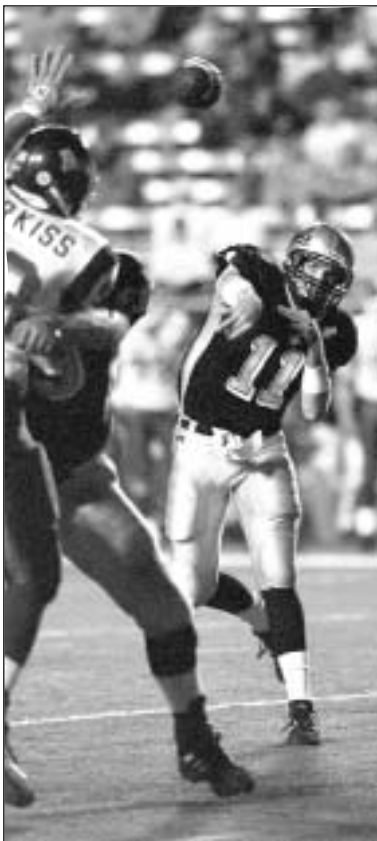
Idaho sports information