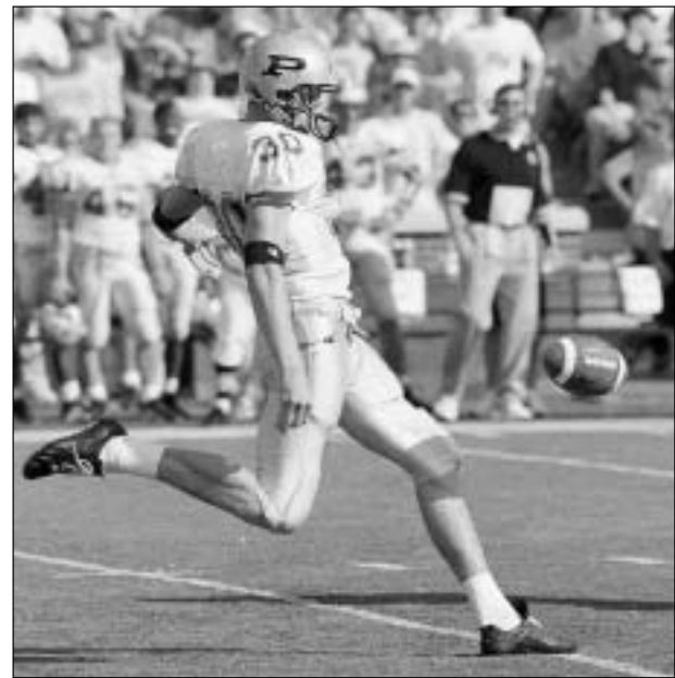
Purdue sports information