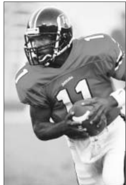
Antwaan Randle El of Indiana was involved in 1,917 rushing and passing plays in his career, a Division I-A record.