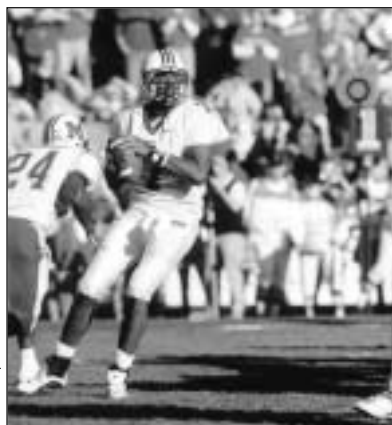
Marshall sports information