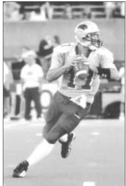
Eastern Illinois' Tony Romo completed two-thirds of his passes last year, which was a big factor in his 178.3 passing efficiency rating. Romo was the Division I-AA leader in that department, and the figure landed him fourth on the division's single-season list.