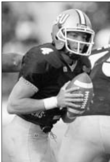
Alabama State sports information