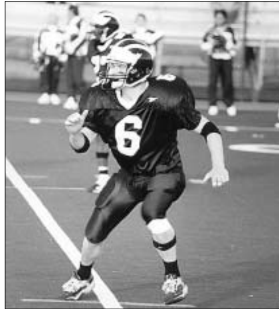
St. Peter's sports information