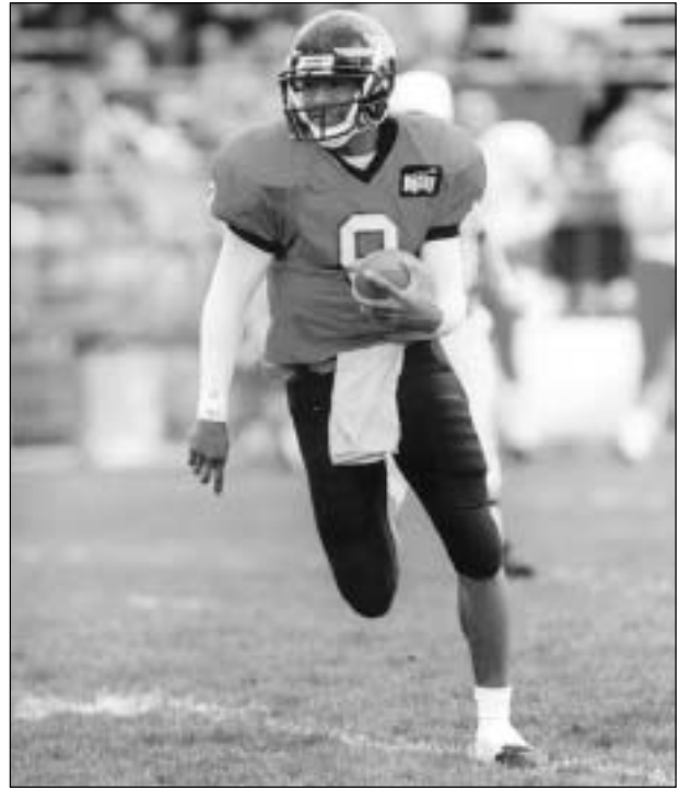
Cal State Northridge sports information