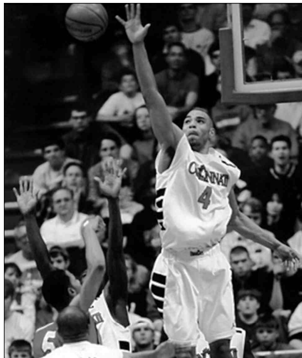
Cincinnati's Kenyon Martin was consensus player of the year last season.

1948—Jim McIntyre 1955—Dick Garmaker 1978—Mychal Thompson