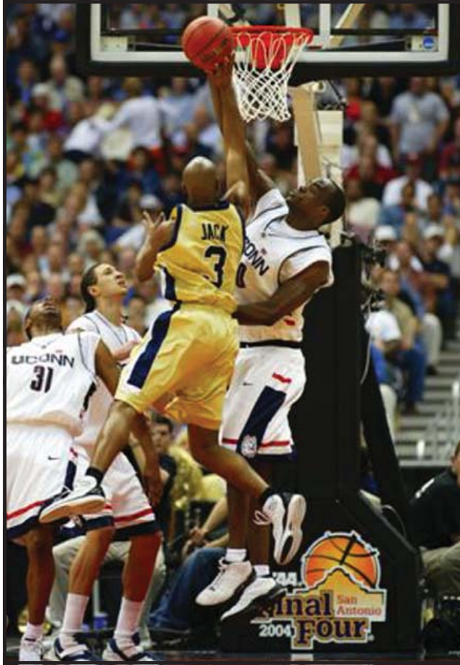
Connecticut's Emeka Okafor blocks the shot of Georgia Tech's Jarrett Jack in the 2004 Final Four. Okafor had led the nation in blocked shots the previous season and was one of the reasons the Huskies led all Division I teams in the average number of blocked shots per game from 2002 to 2009.