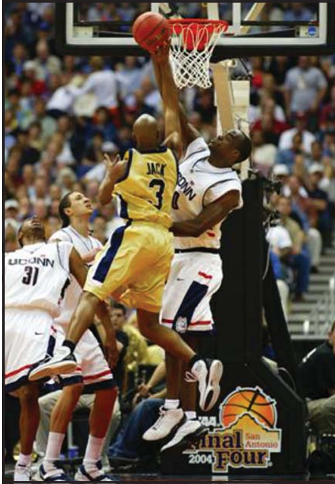
UConn's Emeka Okafor blocks the shot of Georgia Tech's Jarrett Jack in the 2004 Final Four. Okafor had led the nation in blocked shots the previous season and was one of the reasons the Huskies led all Division I teams in the average number of blocked shots per game from 2002 to 2009.