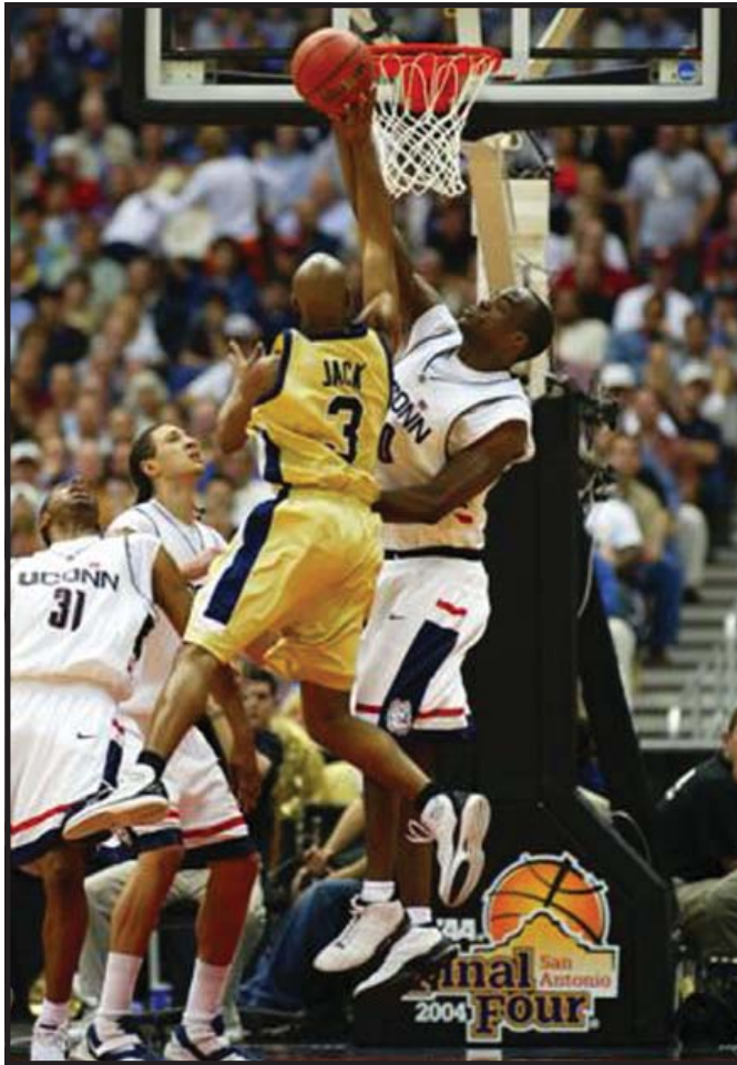
UConn's Emeka Okafor blocks the shot of Georgia Tech's Jarrett Jack in the 2004 Final Four. Okafor had led the nation in blocked shots the previous season and was one of the reasons the Huskies led all Division I teams in the average number of blocked shots per game from 2002 to 2009.