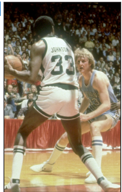
TV's highest-rated college basketball game ever had people tuning in to see the matchup of a pair of 33s, Magic Johnson of Michigan State (left) and Larry Bird of Indiana State (right). Of all the televisions across the country turned on during game time, 38 percent were tuned to Michigan State's 75-64 victory over Indiana State to win the 1979 title.

CH, national championship game; NSF, national semifinal game.