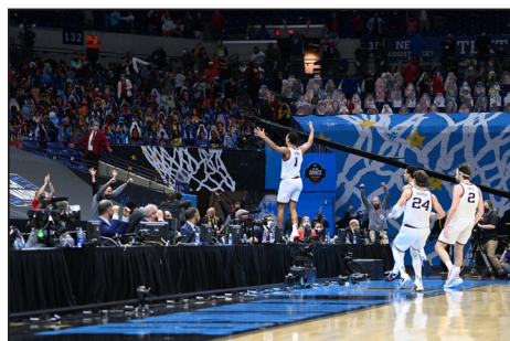
Jalen Suggs (1) celebrates after hitting the game winning shot at the buzzer to beat UCLA in OT in the 2021 national semifinal.

A national championship game is indicated by (CH), a national semifinal game by (NSF), a national third-place game by (N3d) and a team's appearance later vacated by the NCAA/Committee on Infractions (*).