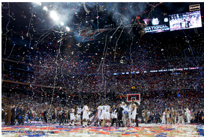
UConn players celebrate as the final buzzer sounds following the 2011 championship game held in Reliant Stadium in Houston. UConn defeated Butler 53-41 to claim the championship title.

2011 As a result of the new television and Internet rights deal that the NCAA reached with Turner Sports and CBS in April 2010, all 67 games of the championship were televised nationally on CBS, TNT, TBS or truTV. In the previous eight years (2003-10), only eight games were available in their entirety nationally to television viewers. The first week of the tournament, including the First Four, recorded a 5.5 rating, a 15% increase from 2010. In addition, the first week recorded the most viewers in more than 17 years while averaging 8.4 million viewers per game. Overall, the television rating for the tournament was a 6.4, up seven percent from 2010 and up 12 percent from 2009.