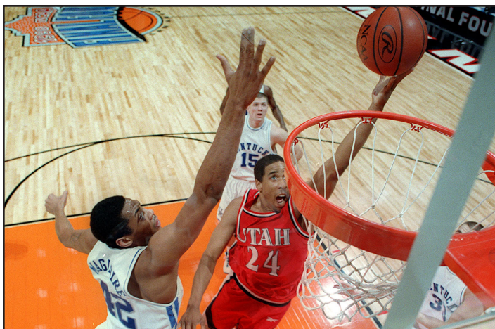
Utah's Andre Miller (24) lays the ball into the basket as Jamaal Magloire (42) tries to block during the national championship held at the Alamodome in San Antonio. Kentucky defeated Utah 78-69 for the championship title.