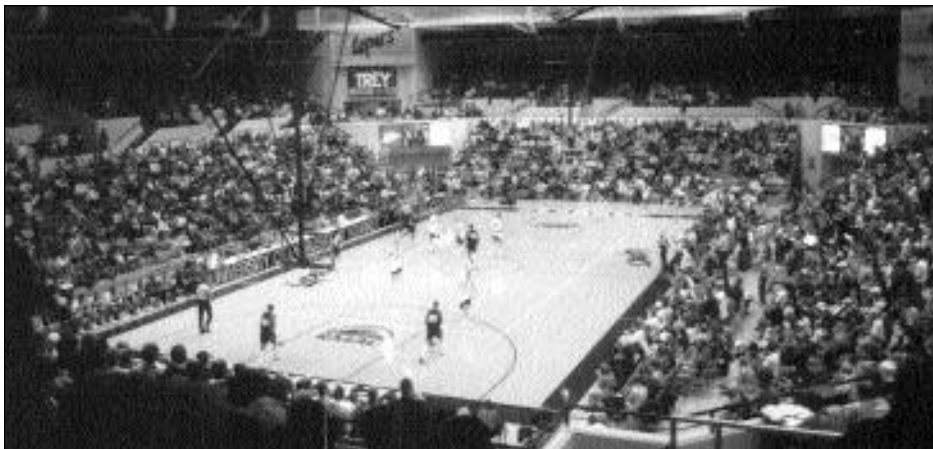
Nebraska-Kearney has amassed a record 86 consecutive home-court victories since Jan 31, 1995.