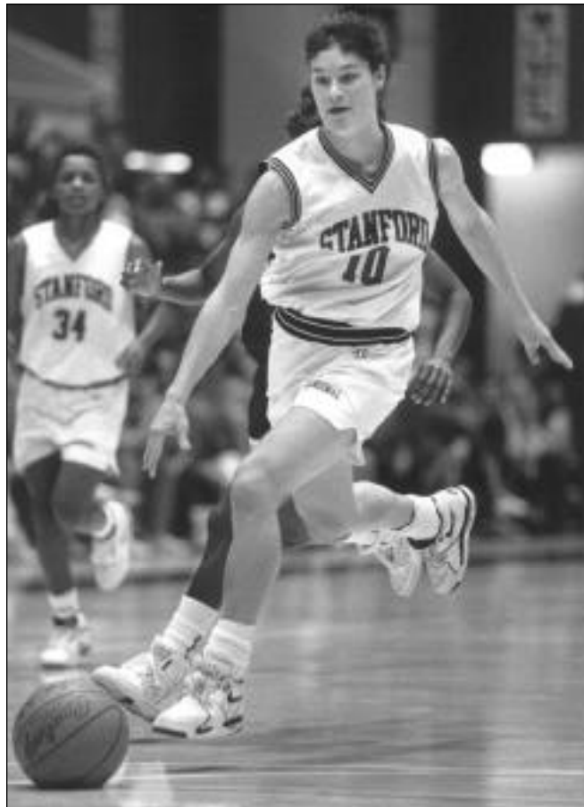
Senior Jennifer Azzi led Stanford to its first NCAA championship, scoring 32 and handing out 10 assists over two games at the Women's Final Four. The Cardinal beat Auburn 88-81 in the title game.

Chamique Holdsclaw, Tennessee Kellie Jolly, Tennessee Ticha Penicheiro, Old Dominion Nyree Roberts, Old Dominion Clarisse Machanguana, Old Dominion