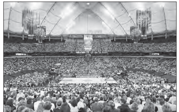
Indianapolis played host to the 2005 Women's Final Four at the RCA Dome.