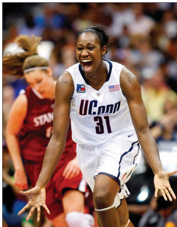
Connecticut's Tina Charles