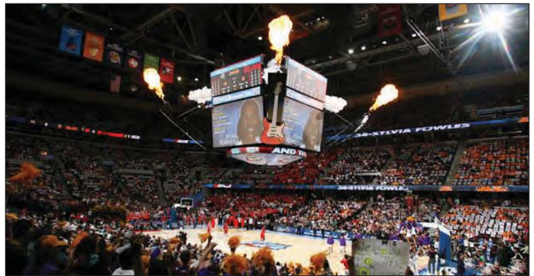
Quicken Loans Arena in Cleveland was the site of the 2007 Women's Final Four.