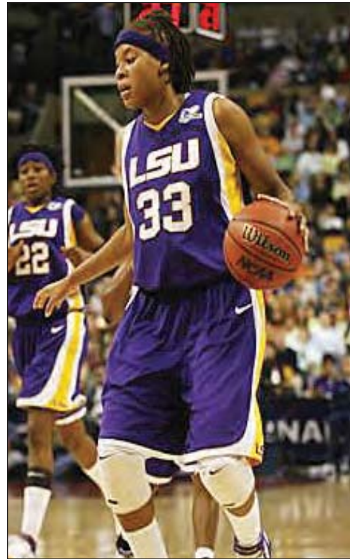
LSU's Seimone Augustus.