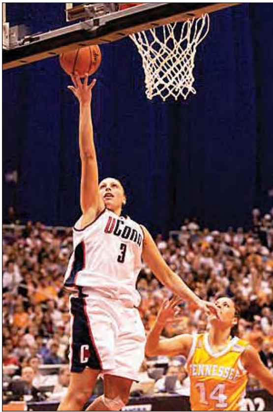
Connecticut's Diana Taurasi at the 2002 Women's Final Four in San Antonio, won by the Huskies.