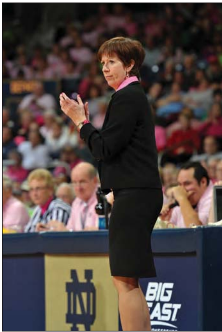
Notre Dame's Muffet McGraw.