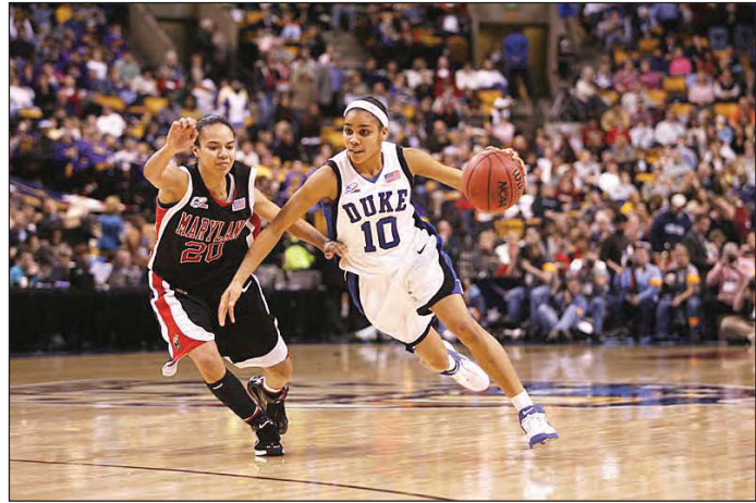
The 2006 women's basketball championship game between Maryland and Duke averaged a 3.1 household rating, up 19 percent from 2005. The 2008 tournament was the most-viewed ever on ESPN and ESPN2.