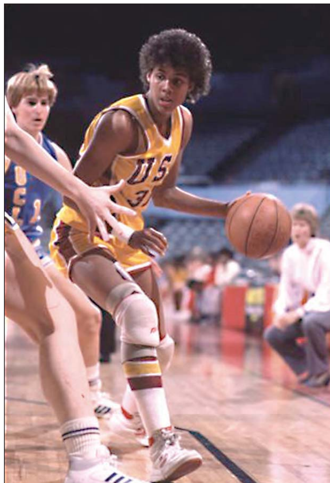
Cheryl Miller of Southern California led her team to the 1983 and 1984 national championships.