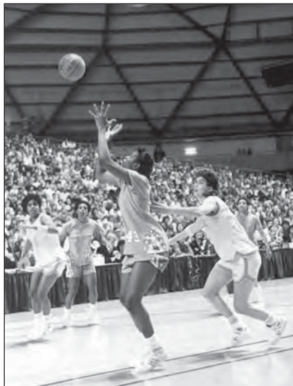
Venus Lacy led Louisiana Tech to the 1988 national title.