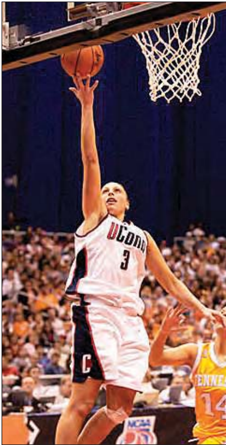
Connecticut's Diana Taurasi at the 2002 Women's Final Four in San Antonio, won by the Huskies.

1 1 1992 MW 1st Springfield Hammonds Student Center 1 1 1993 MW 1st Springfield Hammonds Student Center