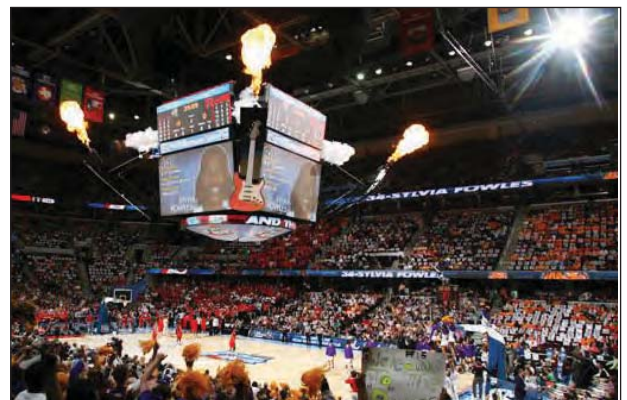
Quicken Loans Arena in Cleveland was the site of the 2007 Women's Final Four.