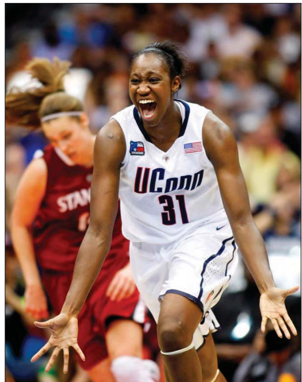
Connecticut's Tina Charles