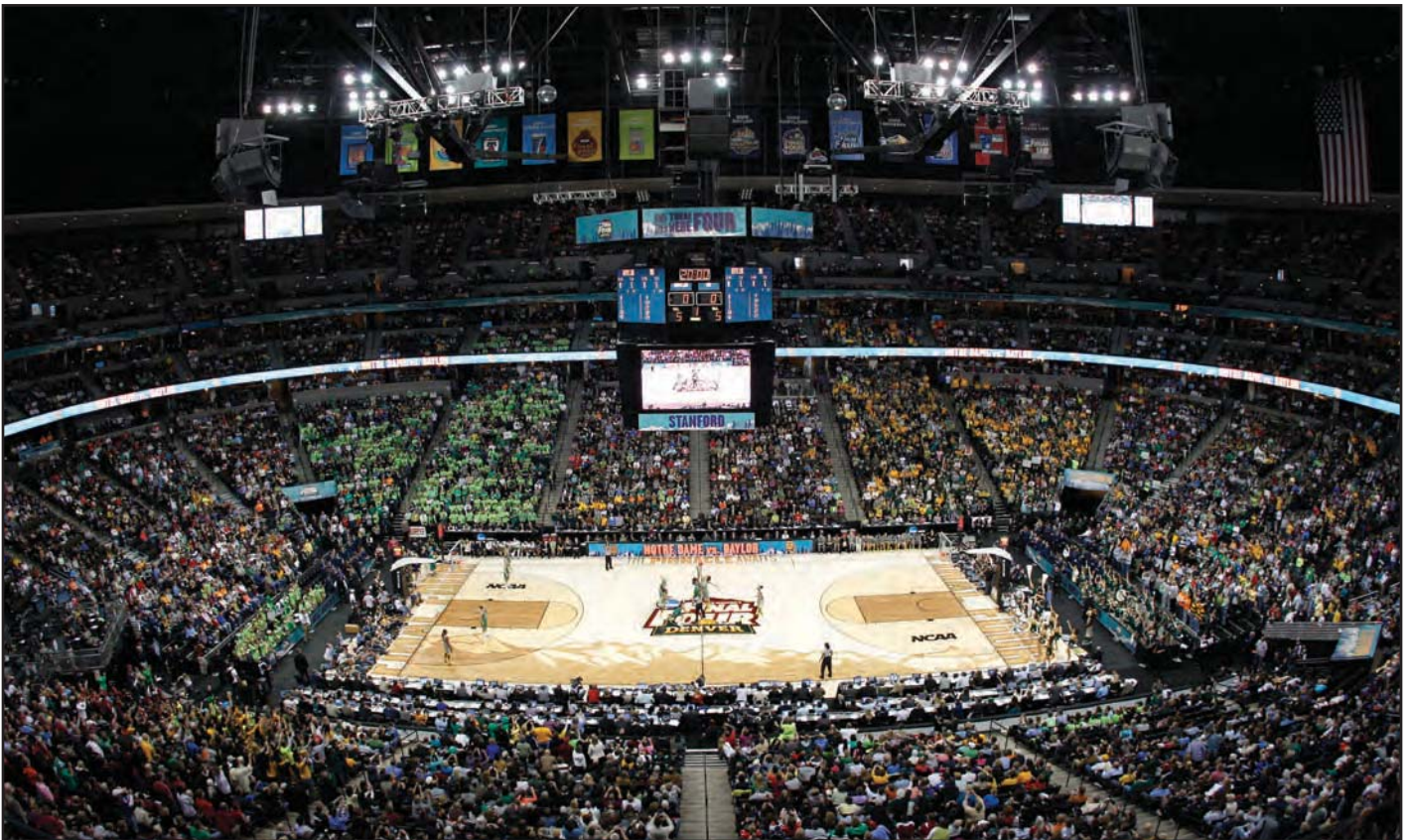
Denver's Pepsi Center, site of the 2012 Women's Final Four