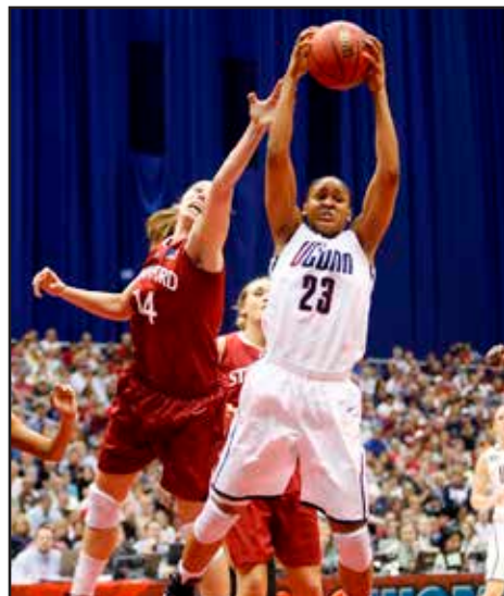
UConn's Maya Moore won the Women's Final Four Most Outstanding Player award, after scoring 57 points and grabbing 23 rebounds in the two games in 2010.

21—Louisiana Tech vs. North Carolina St., 3-27-98