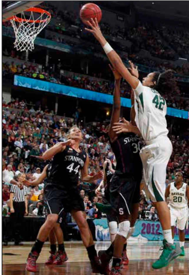
Brittney Griner of Baylor scored 26 points and had 13 rebounds in the 2012 national championship game.