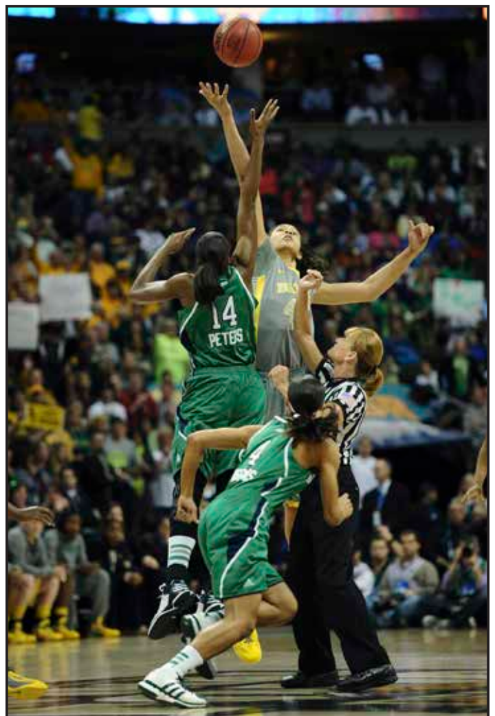
The 2012 Women's Final Four featured four No. 1 seeds in Baylor, Notre Dame, Stanford and UConn.