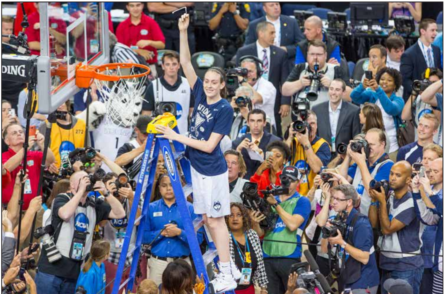
UConn's Breanna Stewart became the first player in tournament history to earn four Women's Final Four Most Outstanding Player awards.