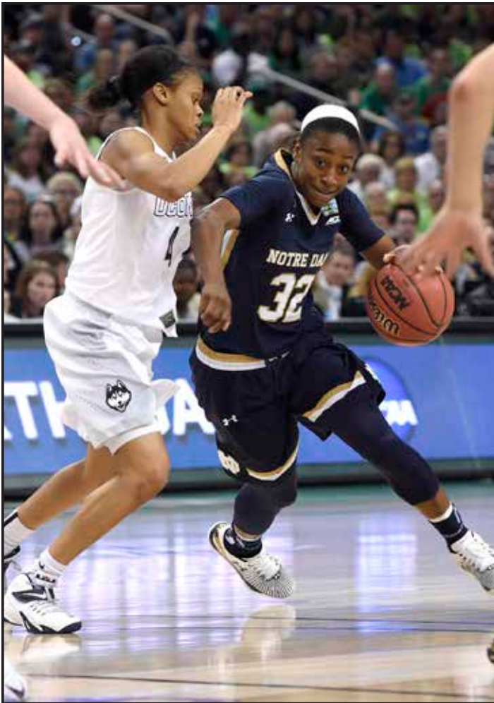
Jewell Loyd helped Notre Dame to the Women's Final Four three straight seasons, 2013-15.