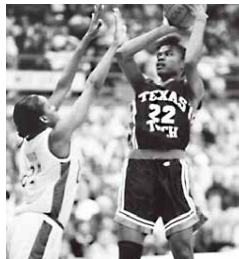
Sheryl Swoopes, Texas Tech, holds the Women's Final Four single game scoring record of 47 points.