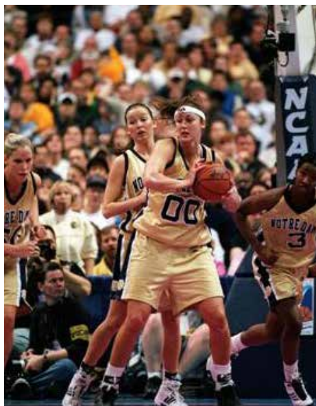
Ruth Riley (00) led Notre Dame to the 2001 national title.