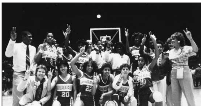
The Women of Troy celebrate their second straight national championship.