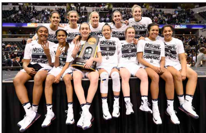
The 2015-16 UConn Huskies: Front Row (L-R): Morgan Tuck, Moriah Jefferson, Breanna Stewart, Saniya Chong, Tierney Lawlor, Napheesa Collier, Gabby Williams. Back Row (L-R): Kia Nurse, Briana Pulido, Courtney Ekmark, Natalie Butler, Katie Lou Samuelson.