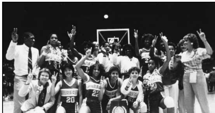
The Women of Troy celebrate their second straight national championship.