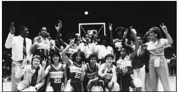
The Women of Troy celebrate their second straight national championship.