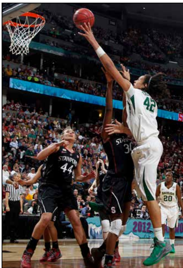
Brittney Griner of Baylor scored 26 points and had 13 rebounds in the 2012 national championship game.