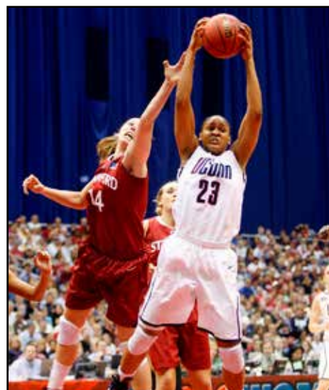
UConn's Maya Moore won the Women's Final Four Most Outstanding Player award, after scoring 57 points and grabbing 23 rebounds in the two games in 2010.