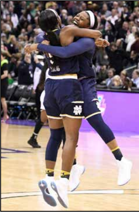
Notre Dame's Arike Ogunbowale celebrates following the 2018 national championship game in Columbus, Ohio.