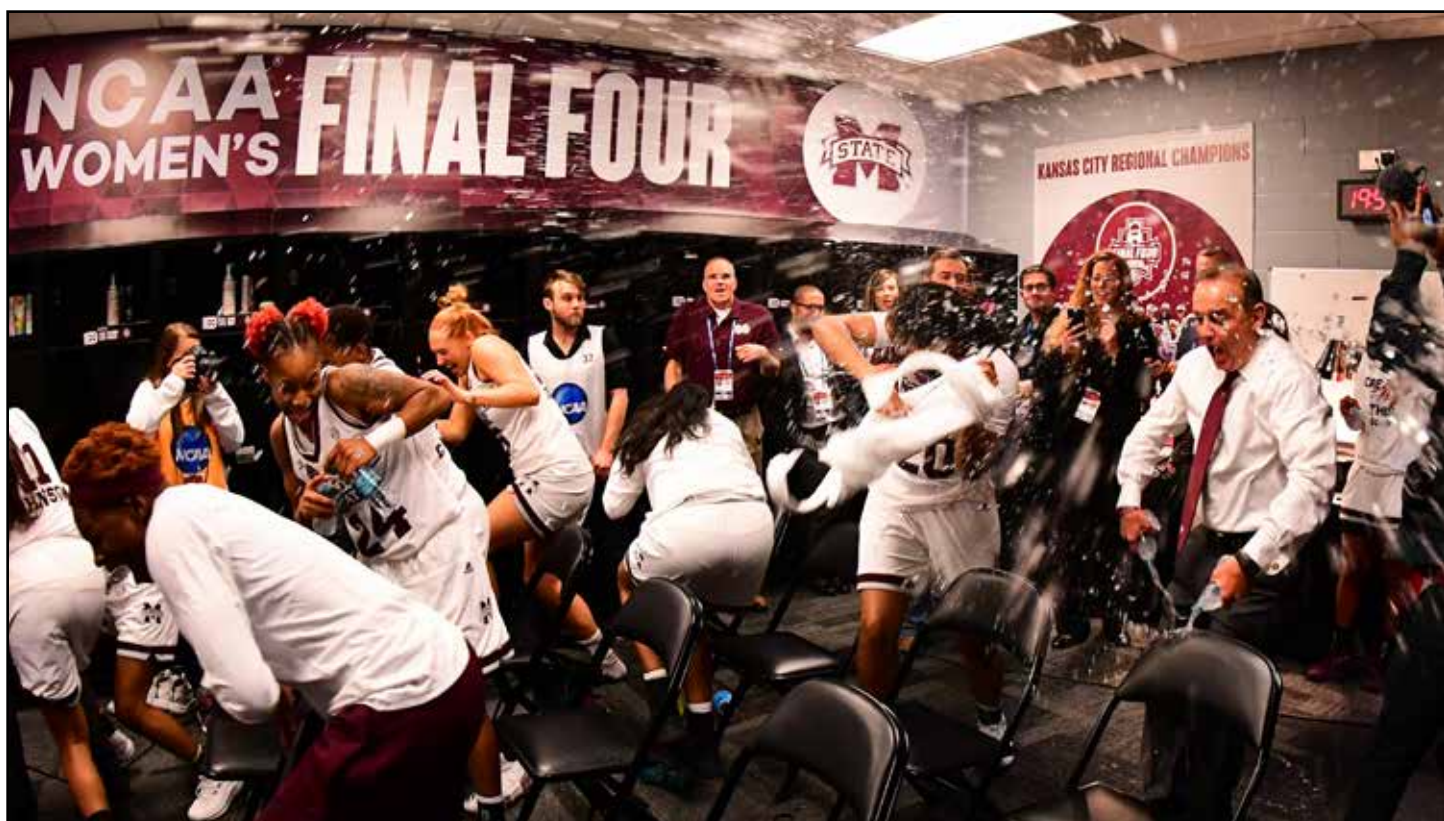
Mississippi State celebrates after beating Louisville, 73-63 in overtime, en route to the 2018 Women's Final Four championship game.