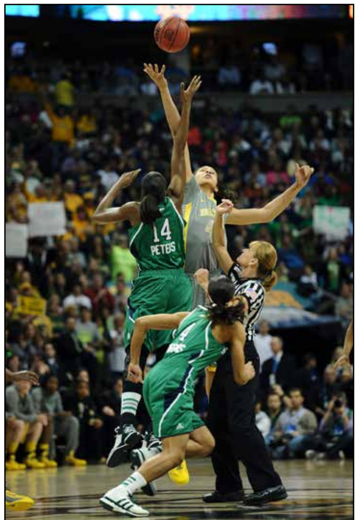
The 2012 Women's Final Four featured four No. 1 seeds in Baylor, Notre Dame, Stanford and UConn.