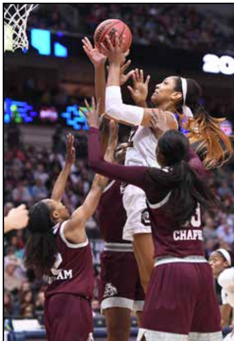
A'ja Wilson of South Carolina captured 29 rebounds during the 2017 Women's Final Four.