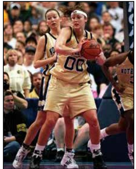
Ruth Riley (00) led Notre Dame to the 2001 national championship.