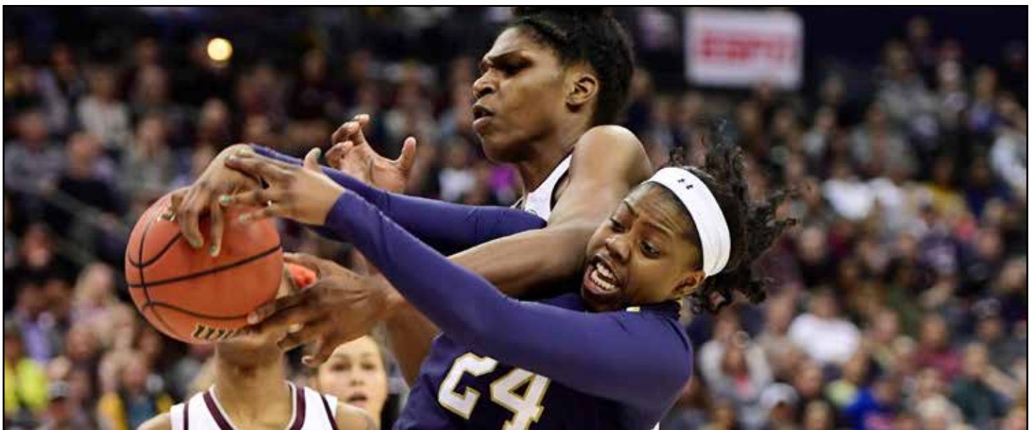
Arike Ogunbowale of Notre Dame and Teaira McCowan of Mississippi State fight for a rebound during the championship game of the 2018 NCAA Women's Final Four.