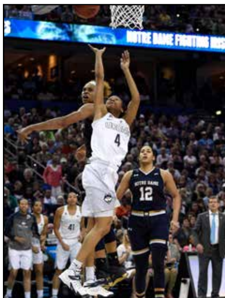
Moriah Jefferson (4) helped lead UConn to four consecutive national titles from 2013-16.

48—Sheryl Swoopes, Texas Tech, 1993 45—Chamique Holdsclaw, Tennessee, 1997 45—Arike Obunbowale, Notre Dame, 2019 44—Maya Moore, UConn, 2010 42—Bridgette Gordon, Tennessee, 1989 42—Dawn Staley, Virginia, 1991 42—Jewell Loyd, Notre Dame, 2015 42—Arike Ogunbowale, Notre Dame, 2018 41—Chamique Holdsclaw, Tennessee, 1998 41—Tamicha Jackson, Louisiana Tech, 1998