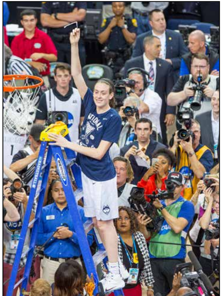
UConn's Breanna Stewart became the first player in tournament history to earn four Women's Final Four Most Outstanding Player awards.