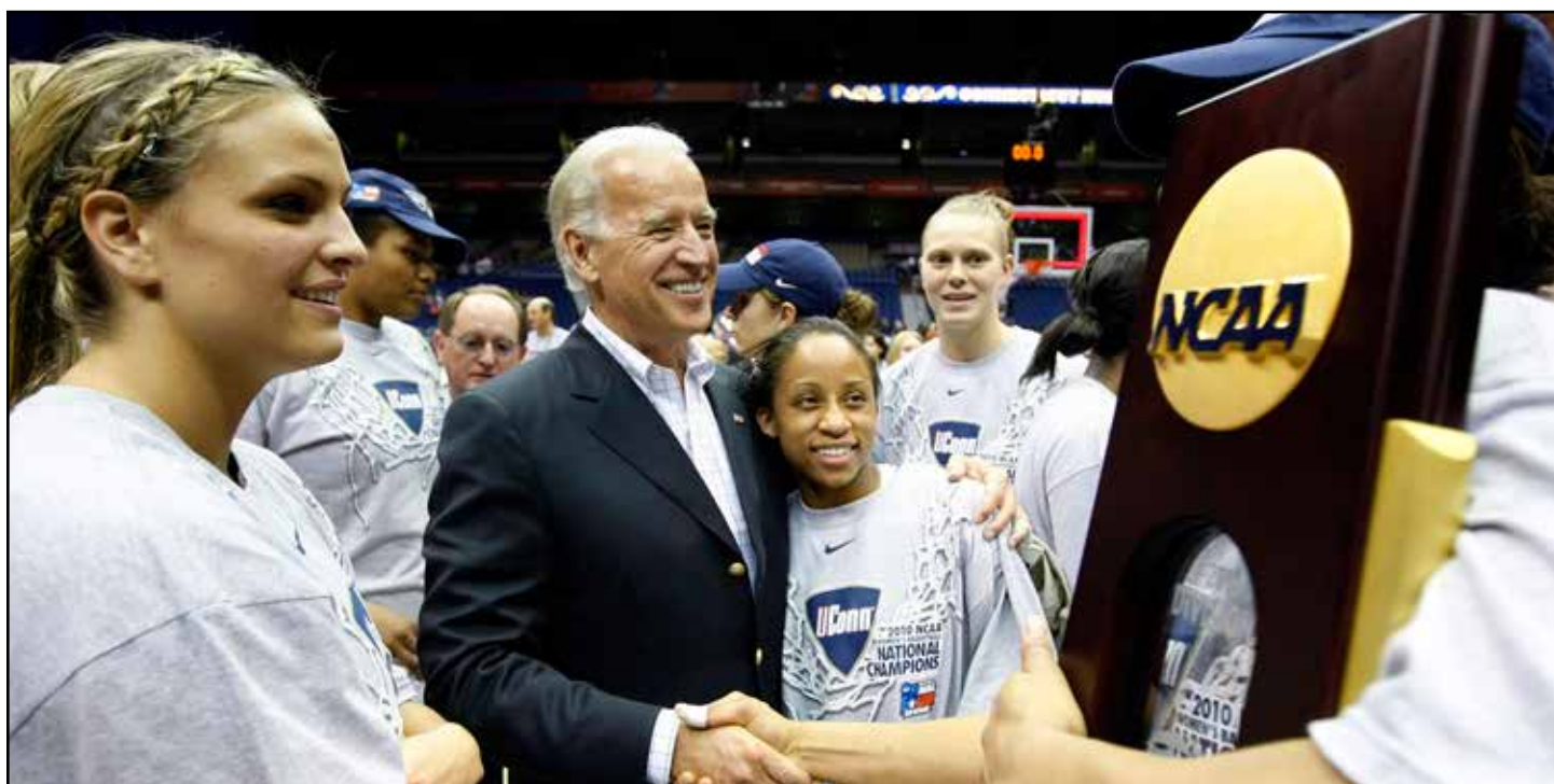
President Joe Biden, vice president at the time, was on hand to congratulate both teams following the 2010 national championship game in San Antonio.