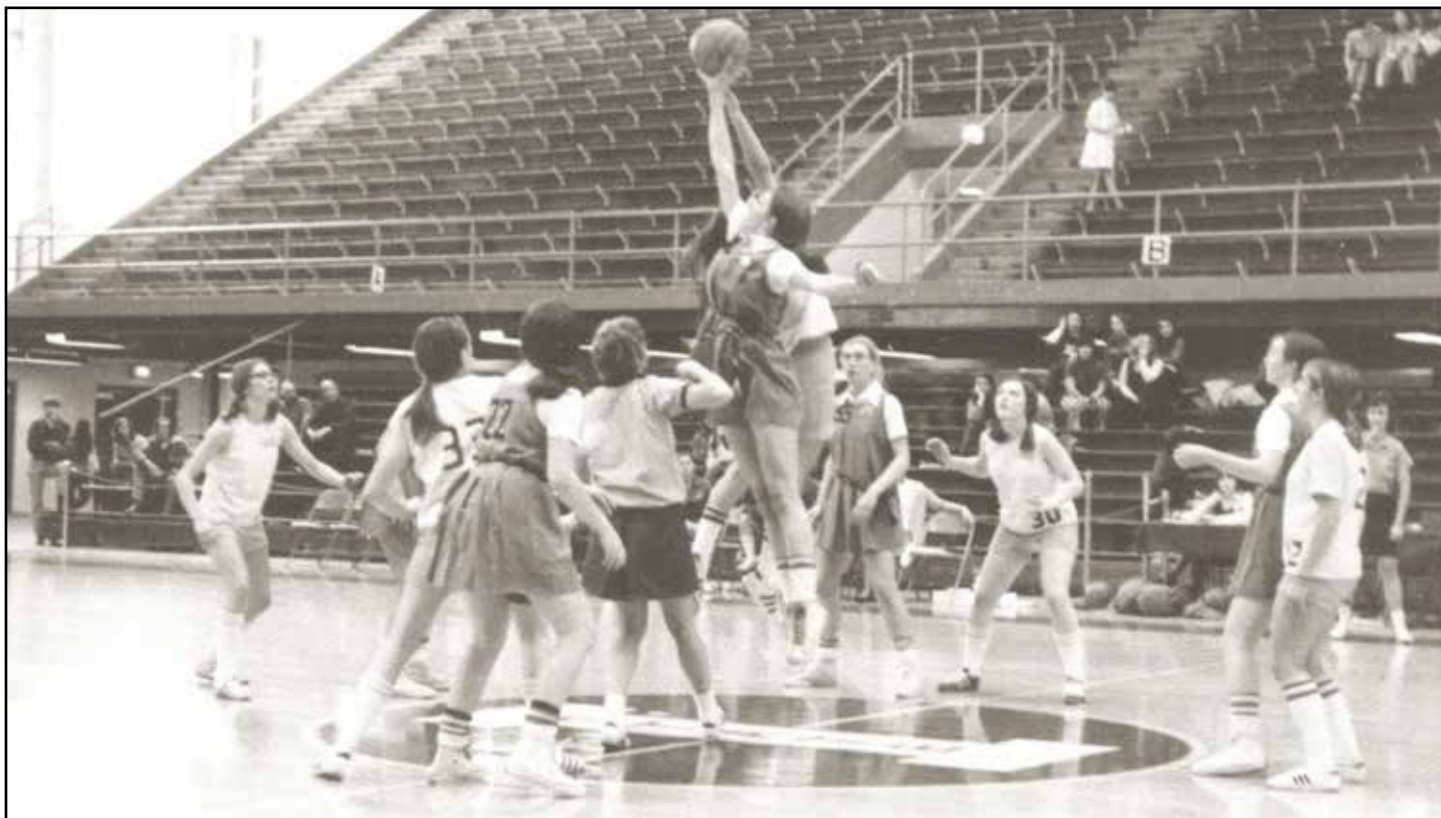
1972 championship game between Immaculata and West Chester.