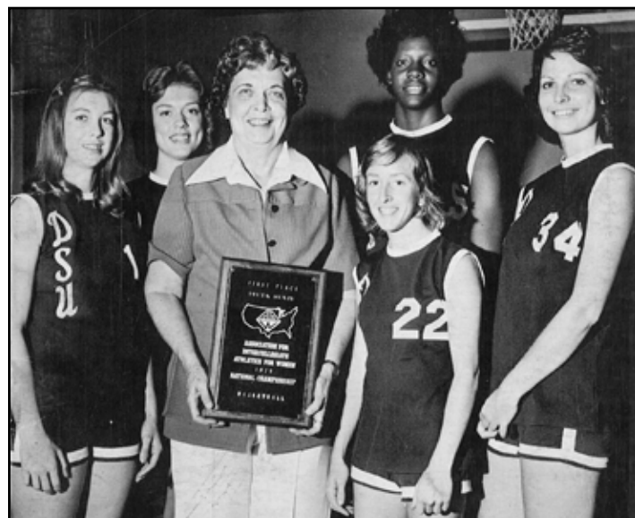
Delta State head coach Margaret Wade led her Lady Statesmen to three consecutive AIAW national championships (1975-77).