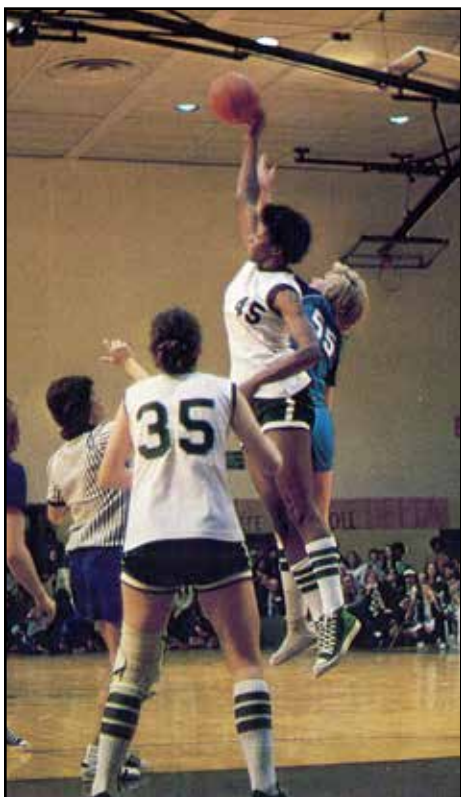
1975 large college championship game between Delta State and Immaculata.