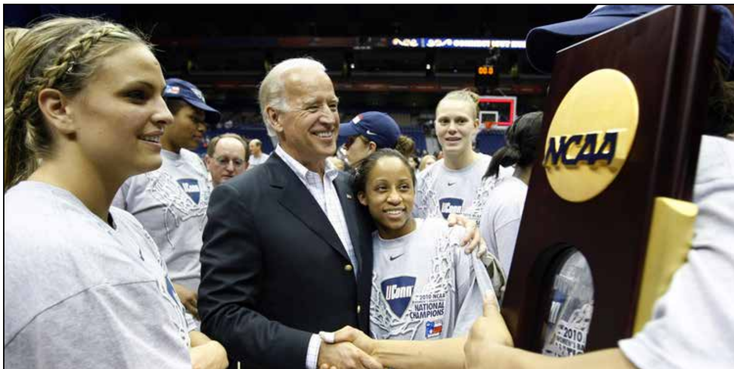
President Joe Biden, vice president at the time, was on hand to congratulate both teams following the 2010 national championship game in San Antonio.