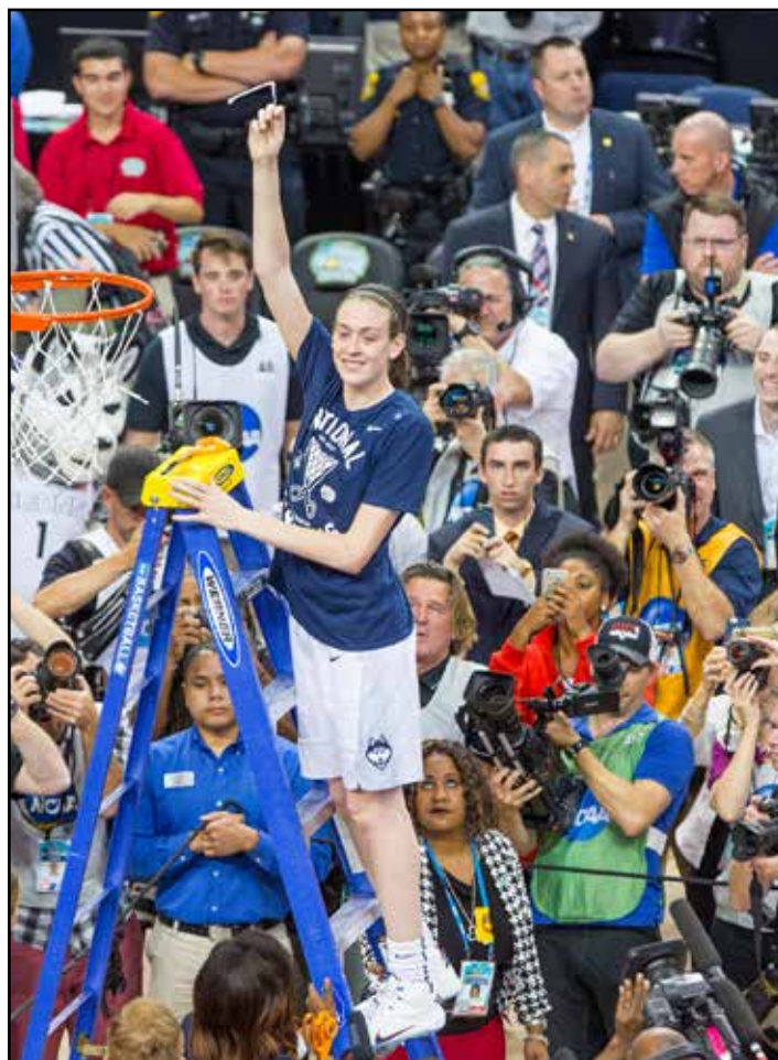
UConn's Breanna Stewart became the first player in tournament history to earn four Women's Final Four Most Outstanding Player awards.