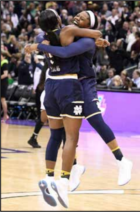
Notre Dame's Arike Ogunbowale celebrates following the 2018 national championship game in Columbus, Ohio.