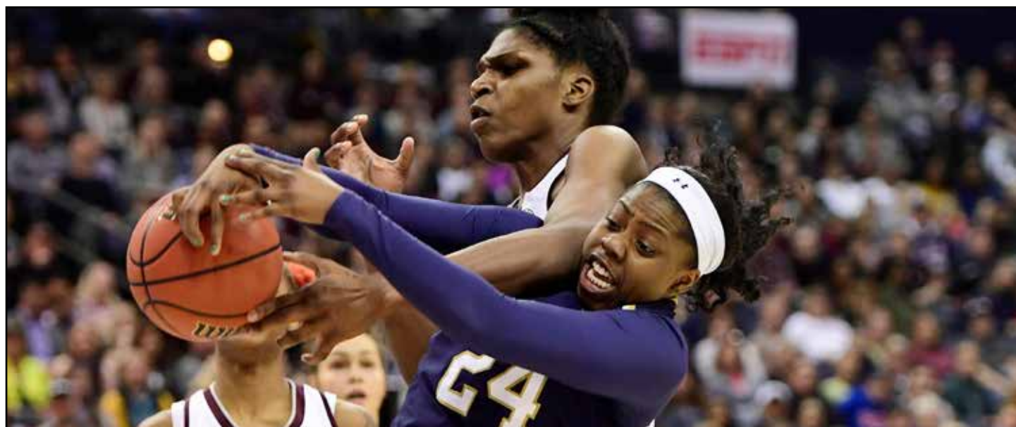
Arike Ogunbowale of Notre Dame and Teaira McCowan of Mississippi State fight for a rebound during the championship game of the 2018 NCAA Women's Final Four.