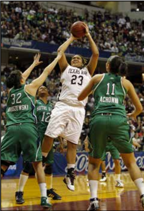
Danielle Adams scored 30 points in the 2011 championship game as Texas A&M won its first national title.