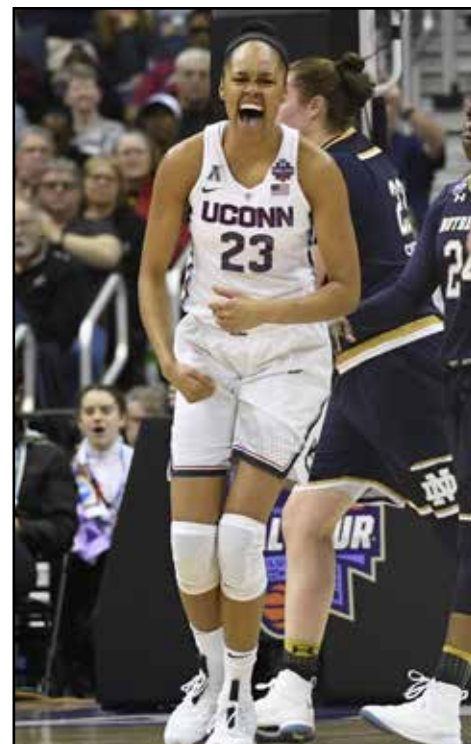
Azurá Stevens during the 2018 Women's Final Four.