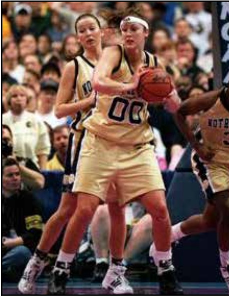
Ruth Riley (00) led Notre Dame to the 2001 national championship.