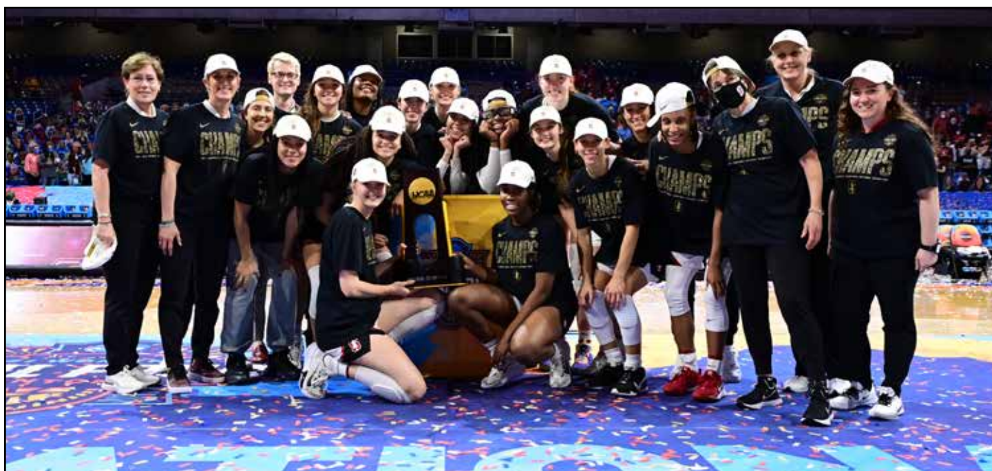
2021 Women's Final Four national champions, the Stanford Cardinal.