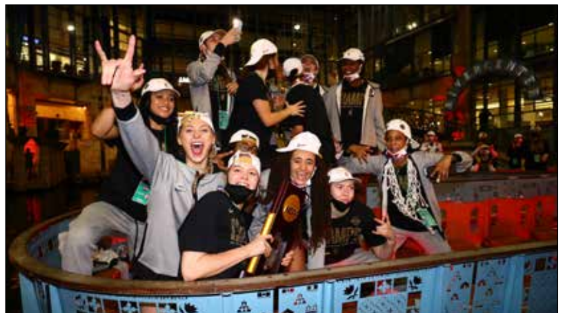
The Stanford Cardinal celebrate their 2021 national championship with a victory lap on the River Walk in San Antonio.

3—Virginia vs. Tennessee, 3-31-91 2—Seven tied (Most recent: Old Dominion vs. Tennessee, 3-30-97)