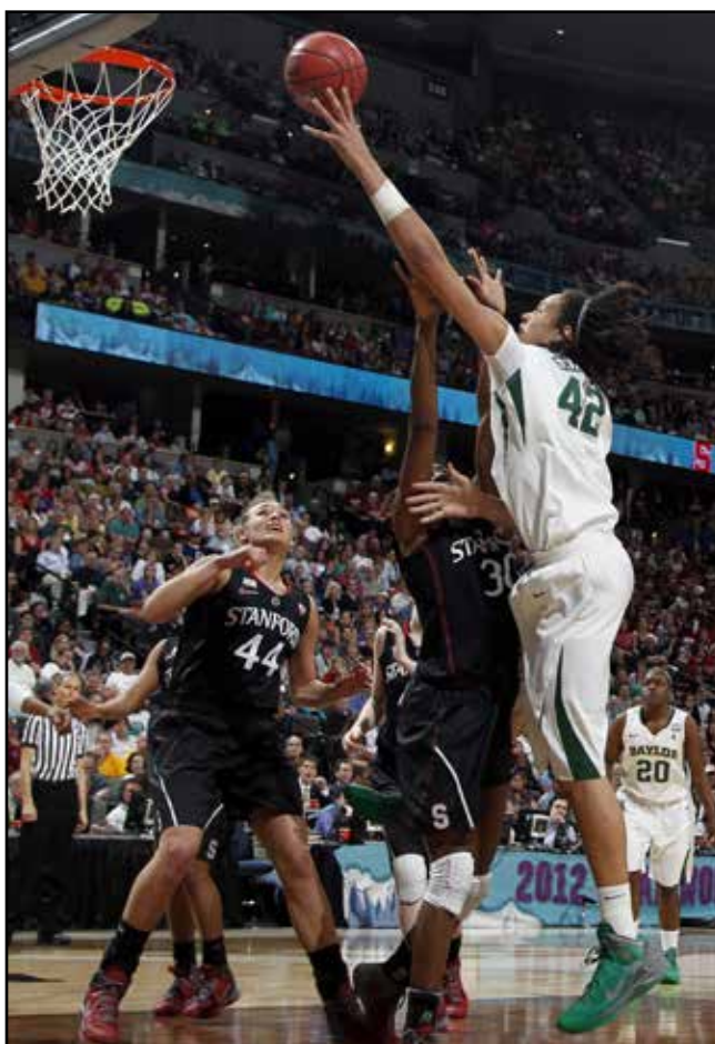
Brittney Griner of Baylor scored 26 points and had 13 rebounds in the 2012 national championship game.