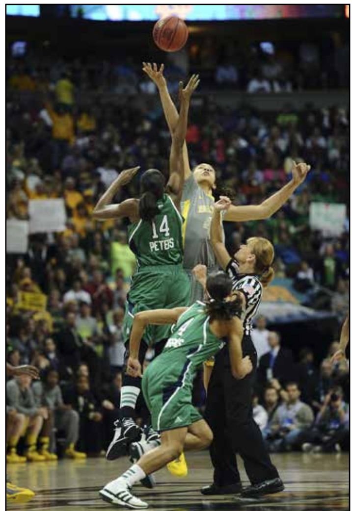
The 2012 Women's Final Four featured four No. 1 seeds in Baylor, Notre Dame, Stanford and UConn.