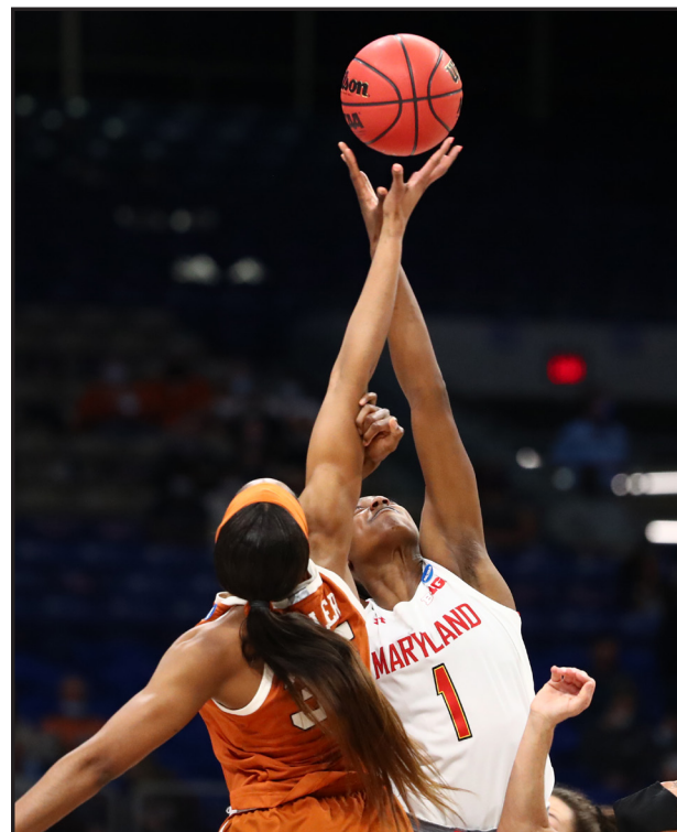
Texas and Maryland face off during the 2021 Hemisfair Regional Semifinals on March 28, 2021.