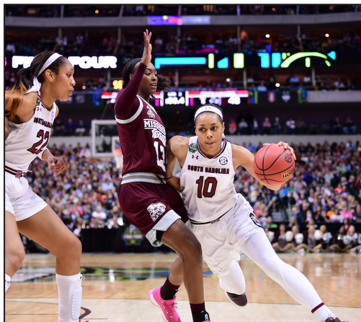
South Carolina's Allisha Gray (10) drives to the basket during the 2017 Women's Final Four in Dallas.