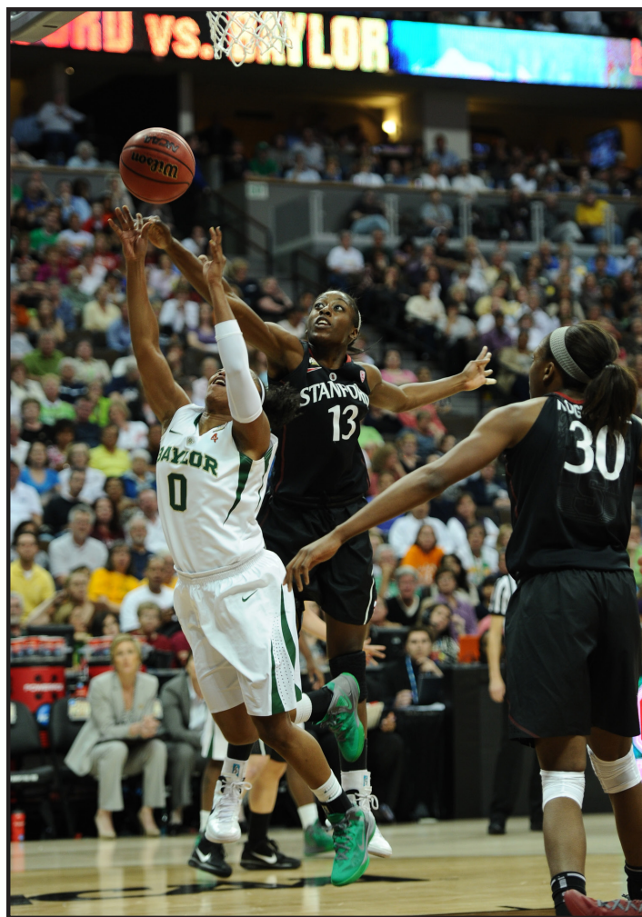
Guard Odyssey Sims (0) of Baylor takes a shot while Chiney Ogwumike (13) of Stanford attempts to block it during the Women's Final Four semifinals at the Pepsi Center in Denver in 2012. Baylor defeated Stanford 59-47 to advance to the championship final.