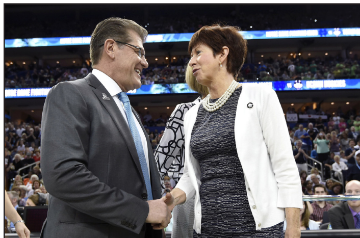
Geno Auriemma, UConn, and Muffet McGraw, Notre Dame, before the 2015 title game.