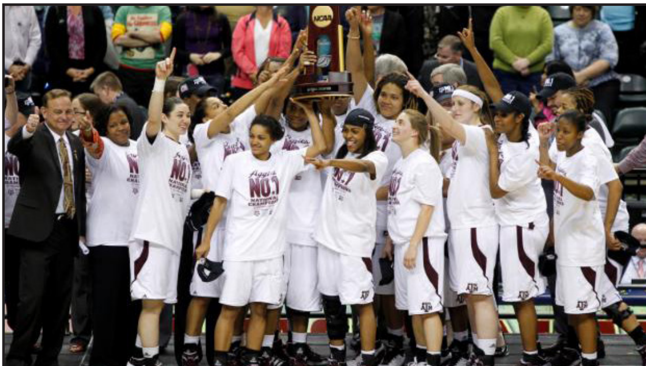
Texas A&M, 2011 national champions.