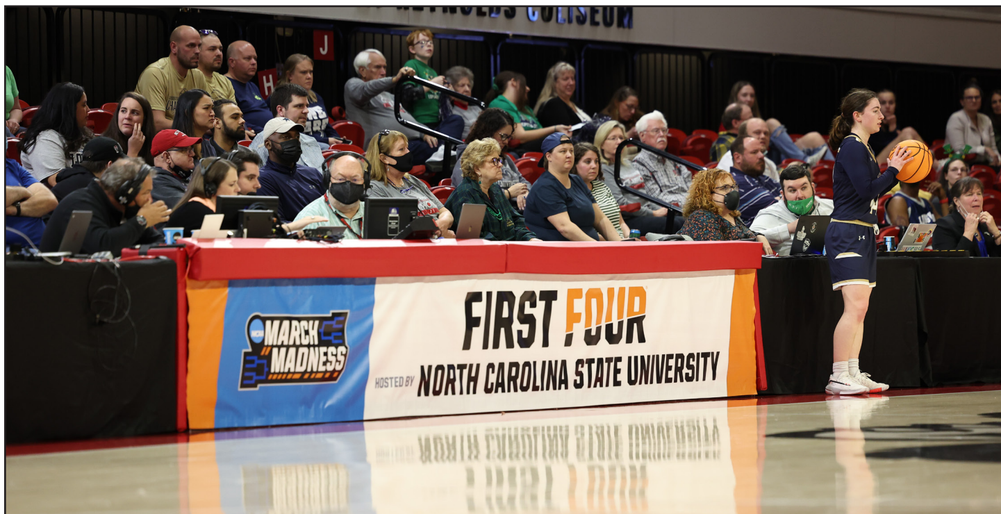
2022 saw teams competing in the inaugural First Four. Games were held at Iowa State, LSU, NC State and South Carolina.

Women's Final Four: San Antonio, Texas. Teams: Arizona, South Carolina, Stanford, and UConn.