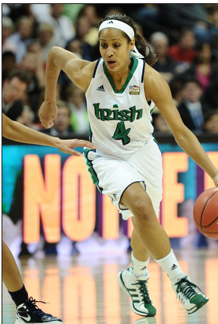
Notre Dame's Skylar Diggins had a career total of 102 assists from 2011-13.