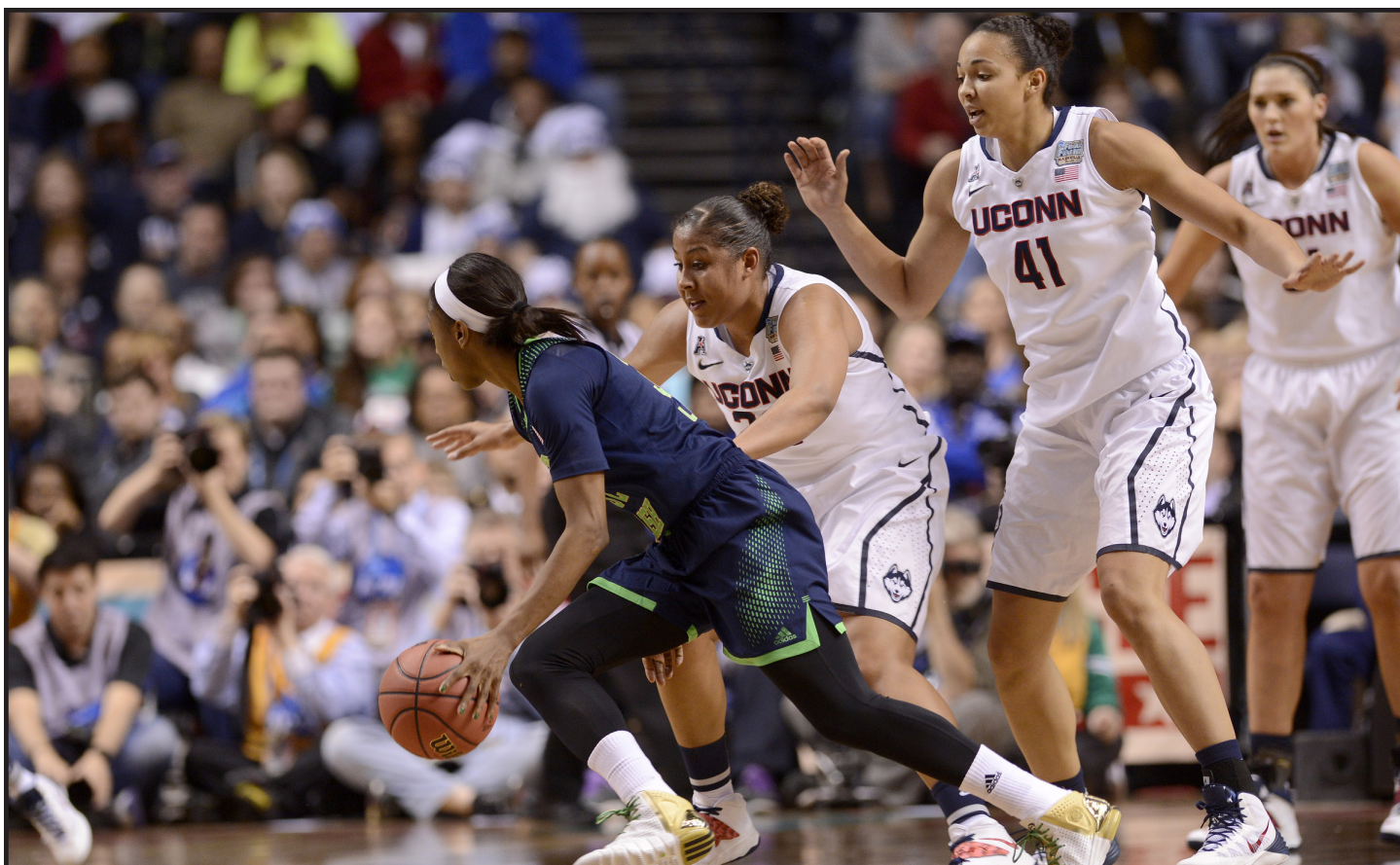
The 2014 national championship game featured two undefeated teams in UConn and Notre Dame and drew a 2.8 rating on ESPN.

In an ESPN first, Tennessee head coach Pat Summitt's record-breaking 880th win in the Lady Vols' second-round game versus Purdue was captured live on six domestic ESPN television networks – ESPN, ESPN2, ESPNU, ESPNEWS, ESPN Classic and ESPN Deportes. The entire game was carried on ESPNU and ESPN2, while the other networks joined live with less than two minutes to go and stayed through Summitt's postgame interview.