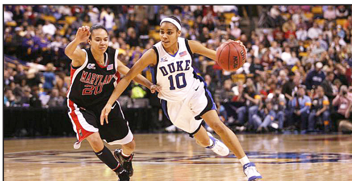
The 2006 Division I Women's Basketball Championship game between Maryland and Duke averaged a 3.1 household rating.

Beginning in 2003, ESPN began broadcasting all 63 games of the championship with the first- and second-round games offered in a whiparound-styled coverage to most of the nation and regionalized/protected coverage in the home markets of the competing teams. The regional semifinals, regional finals, national semifinals and national championship game are televised nationally.