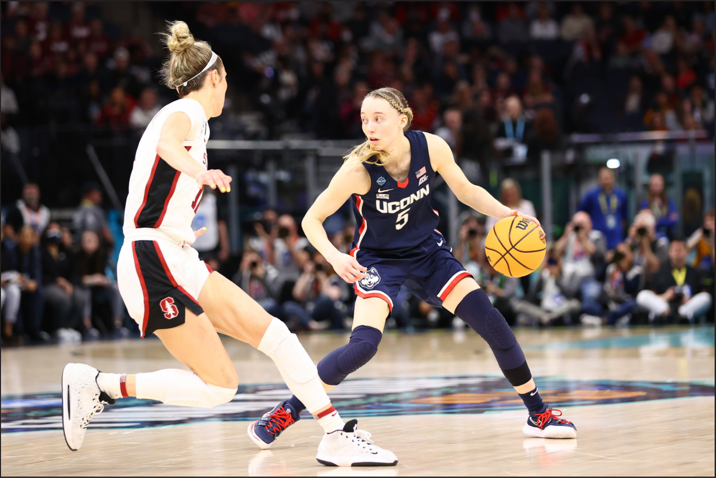
Paige Bueckers of UConn and Lexi Hull of Stanford during the 2022 Women's Final Four.