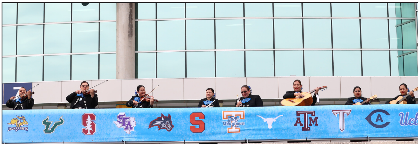
In true Texas fashion, a mariachi band serenaded the 2021 regional final teams as they entered the Alamodome in San Antonio.

Women's Final Four: Dallas. Teams: South Carolina, Mississippi State, UConn and Stanford. In a Women's Final Four that witnessed UConn's record 111-game winning streak come to an end, South Carolina (33-4) emerged to win its first national championship. In an all-Southeastern Conference national championship game, South Carolina outlasted Mississippi State 67-55. The Gamecocks were led offensively by a pair of double-doubles from junior guard Allisha Gray (18 points, 10 rebounds) and junior forward A'ja Wilson (23 points, 10 rebounds). Beyond being named to the all-tournament team, Gray and Wilson were the only two players on the South Carolina roster to tally double figures in the scoring department in each of the team's six NCAA tournament games. Wilson was named the Women's Final Four Most Outstanding Player.