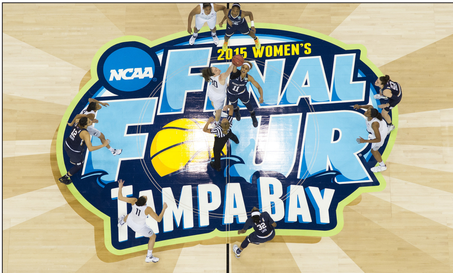
Amalie Arena in Tampa Bay has played host to the Women's Final Four in 2008, 2015 and 2019.

Women's Final Four: Tampa Bay. Teams: UConn, Notre Dame, Maryland and South Carolina. UConn won its third straight national championship, improved to 10-0 in national championship games and claimed its record 10th team title. The Huskies defeated Notre Dame, 63-53, in the title game played at Amalie Arena. UConn junior Breanna Stewart was named the tournament's Most Outstanding Player for the third consecutive season.