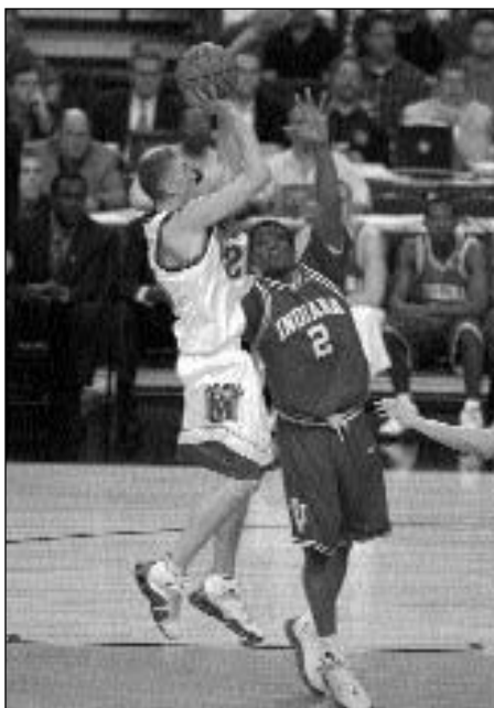
Point guard Steve Blake directed Maryland to the title.